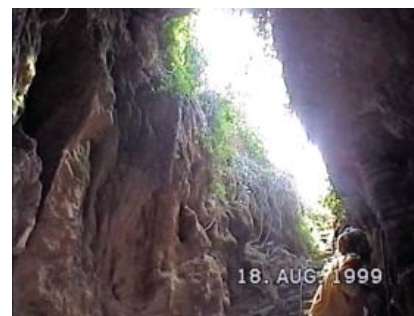
The top exit hole