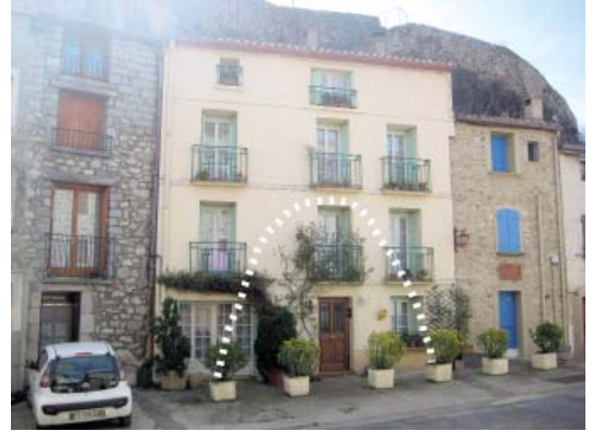
An impression of the size of the arch behind the houses

This natural cavern is a large uneven space, about 10 m by 15 m in area and about 7 metres high.