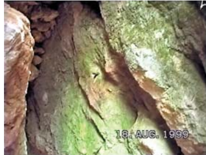
The wall of the cavern