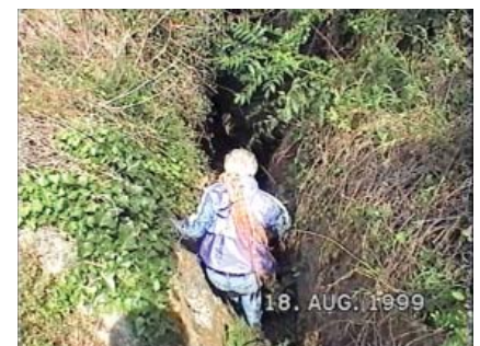
The exit seen from above (D). Presumably it would have been inside the castle.

To see the video itself (6 mins) click on: https://youtu.be/K9XgJ6HOrml