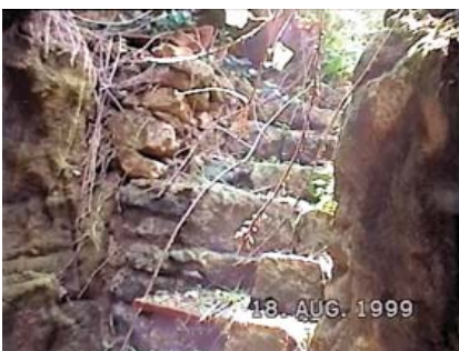
The staircase near the top