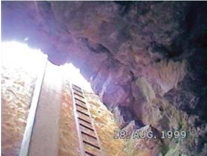
Part of the arch at the rear of the houses (B)