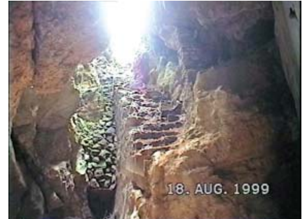
The staircase (C)